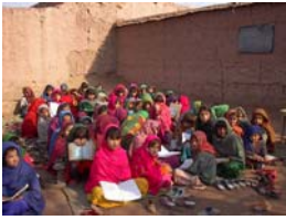
1 Afghan Refugee students in Pakistan