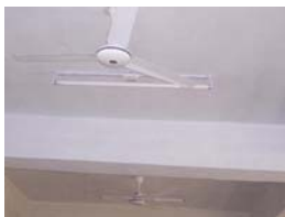
32 Ceiling fan