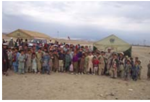
2 Tent school at site Jalalabad, Afghanistan