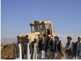
6 Construction begins Spring 2003