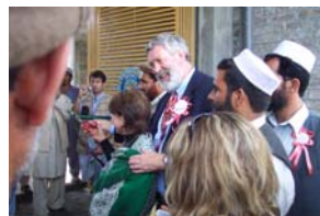
34 Ribbon Cutting