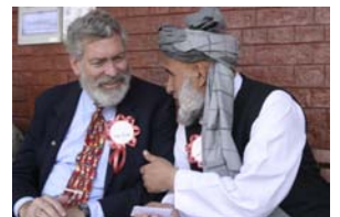
35 Dedication Ceremony March 13, 2004