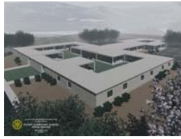
3 school rendering