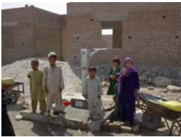
11 Water well provided by US Military