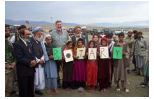
5 Groundbreaking Nov 2002