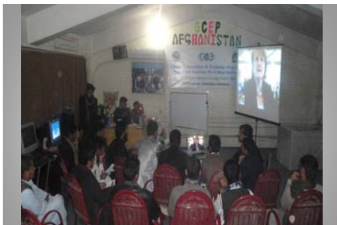
UNDER SECRETARY OF STATE JUDITH MC HALE TALKS TO JALALABAD HIGH SCHOOL STUDENTS VIA SKYPE

Students from various high schools in Jalalabad met at one of our central sites and participated in a live video conference call with students in the United States. Judith McHale, under Secretary of state for Educational and Cultural Affairs, participated in this conference.